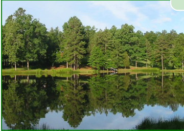
Issue No. 5